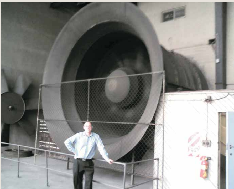
One of the fresh air intake fans installed at the Lyttleton Road Tunnel